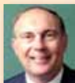
The Hon Warren Truss MP Minister for Transport and Regional Services

A third generation grain farmer from the Kumbia district near Kingaroy, Warren Truss entered Federal Parliament in March 1990 as The Nationals' MP representing the diverse and fast growing electorate of Wide Bay in south-eastern Queensland.